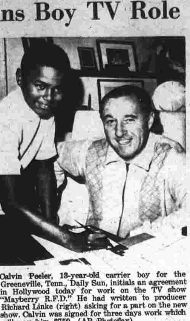
FOR POTTERY EXHIBIT AT CONNECTICUT

Manchesterville Lumber BANK CREDIT CARDS ACCEPTED ARTHUR DRUG BIRCH PAINTING Install it yourself and save. Beautiful Patterns $6.60 4 1/2" x 8 1/2" Panels Maintenance free wall that never need painting is only one of the many advantages of our new panel. Easy installation and economical price all make pre-finished paneling the most desired allweather material for today's modern home.