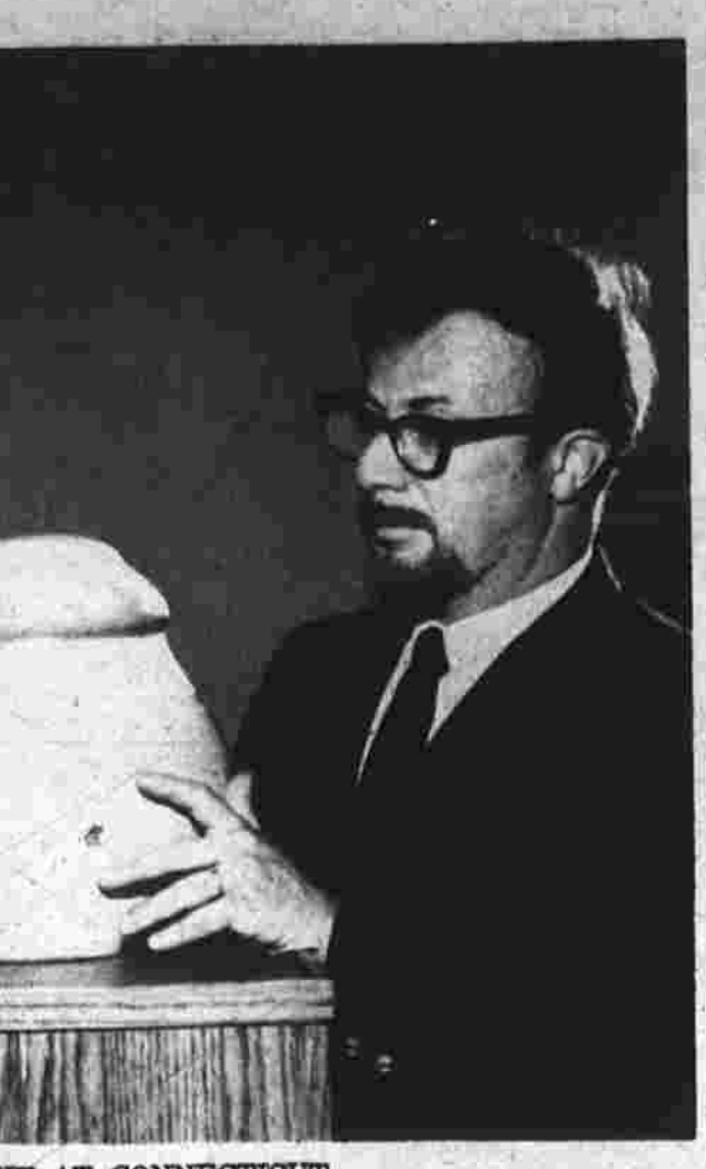
FOR POTTERY EXHIBIT AT CONNECTICUT