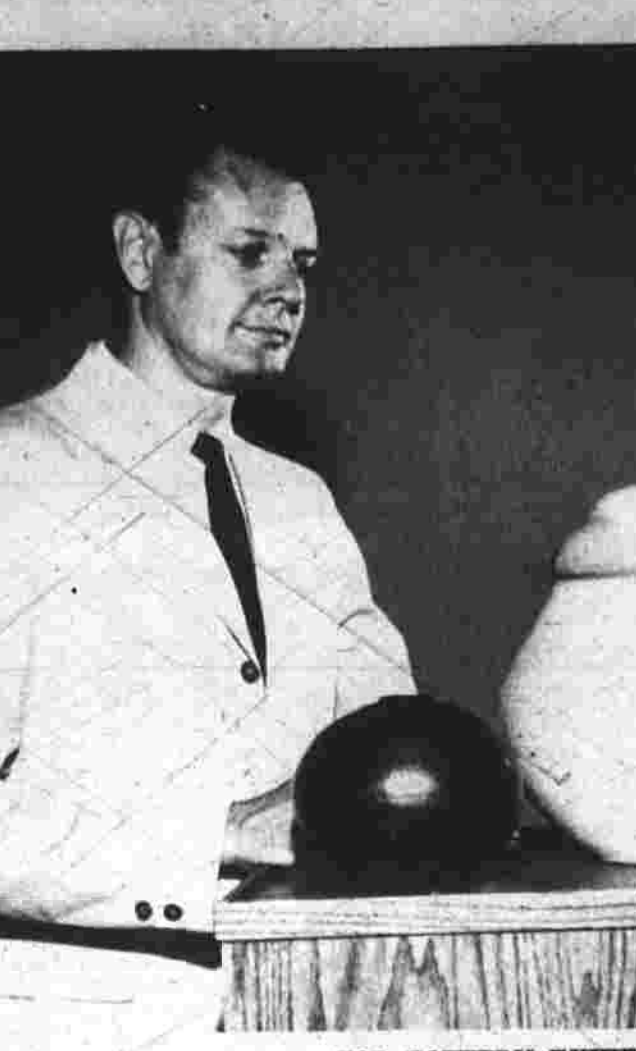
FOR POTTERY EXHIBIT AT CONNECTICUT

Blameless of Not Being 21 There is quite likely to be, from now toward November, a growing gravity in the typical American face. It will seem furrowed by the necessity to make its decision from among a field of Humphrey, Nixon, Wallace and perhaps even Clinton. It will not be able to disguise its feeling that this is an onerous, difficult task, one which makes the privilege of the franchise truly a weighty, sacrificial contribution to the welfare of the Republic. All over America, all over every American face, will be able to witness